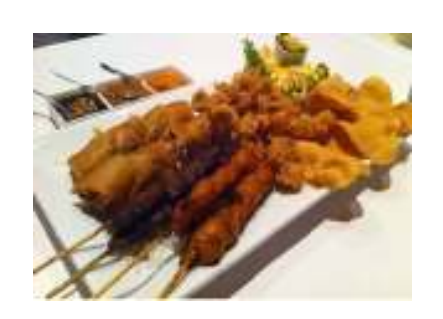
01. Thai Platter marinated chicken stick, breaded pork stick, thai fish cake, mini ribs and duck spring rolls

€ 7.95 for 1 person €15.50 for 2 persons