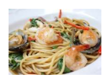
37. Spaghetti Pad Kee Mao Talay spaghetti thai style with prawns, squid, mussels and oyster sauce