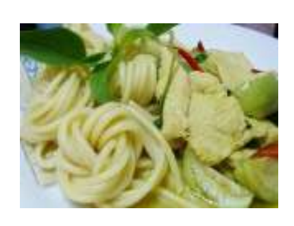
38. Spaghetti Gaeng Kiew Wan Gai spaghetti thai style with chicken and green curry sauce