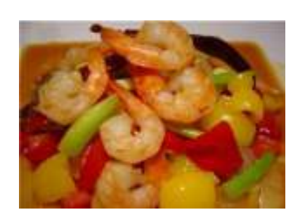
28. Pad Priao Wan Kûng prawns cooked in sweet & sour