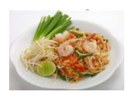
43. Pad Thai Shrimp

blended noodles with shrimp, tamarind, soy and vegetables finished with crushed peanuts