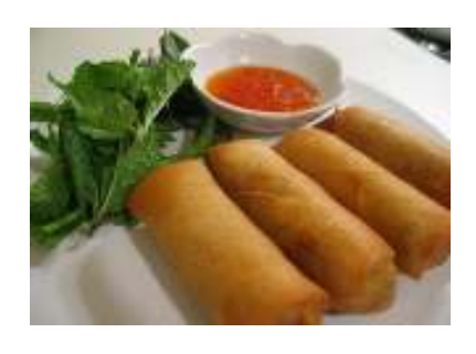
04. Por Pia Tod duck spring rolls served with sweet chilli sauce