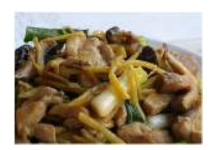
35. Nuea Pad Khing stir fry ginger with beef