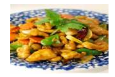
29. Pad Himmapan Gai chicken cooked with cashew nuts