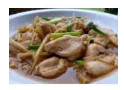
34. Moo Pad Khing stir fry ginger with pork