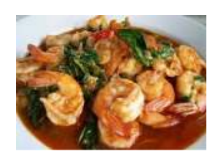
18. Pad Krapow Kûng traditional thai prawns with basil