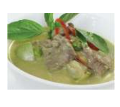
19. Gaeng Kiew Wan Nuea beef cooked in green curry and green vegetables