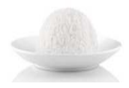
46. Khao Suay steamed jasmine rice