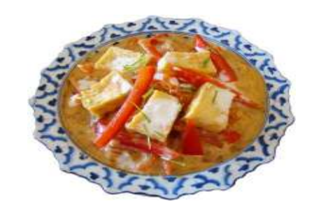
14. Panang Pla fish cooked in red curry