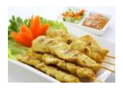
02. Gai Satay grilled marinated chicken sticks served with satay sauce

€ 7.95 for 1 person €15.50 for 2 persons